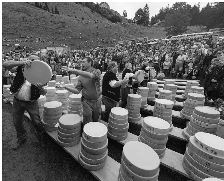
"Chästeilet" is a tradition in the Swiss Alps in which alpine cheeses is distributed among the commonsers.

In order to attain these goals, the IASC organizes (among other things) regional, thematic, and biennial global conferences. Forthcoming conferences already scheduled are the 3 rd Thematic IASC-Conference on Knowledge Commons (Paris, 20-22 October 2016) and the XVI Biennial Conference (Utrecht, 10-14 July 2017, see www.iasc2017.org ). Also, the IASC issues the peer-reviewed, open-access academic journal International Journal ( www.thecommonsjournal.org ) of the Commons and the quarterly Commons Digest ( http://www.iasc-commons.org/commons-digest ). Next to this, the IASC issues a regular newsletter. Not yet a member? Look at https://membership-iasc-commons.org for more info.