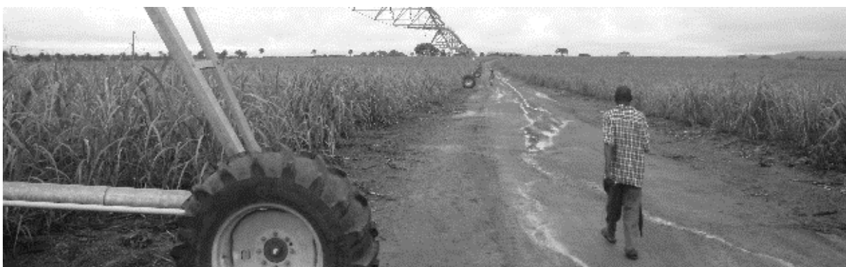
Large-Scale Land Investment of a Swiss Company in Sierra Leone (see Panel #A09)

In addition, Switzerland is one of the world’s leading financial marketplaces, and hosts the headquarters of large multinational companies in mining and agro-business that represent global players at critical glocal interfaces concerning e.g. the global land rush, mining, oil and gas commodity extraction, and commodity trading. Switzerland is also home to the United Nations and many international conservation organizations (e.g. IUCN and WWF), and a hub for international treaties and legal affairs. Switzerland is therefore one of the prime examples of local participation in resource management while at the same time being a centre for globalized capitalism and its norms and values. This is an interesting paradox that relates to the conference theme of Commons in the “Glocal” World: Global Connections and local responses.