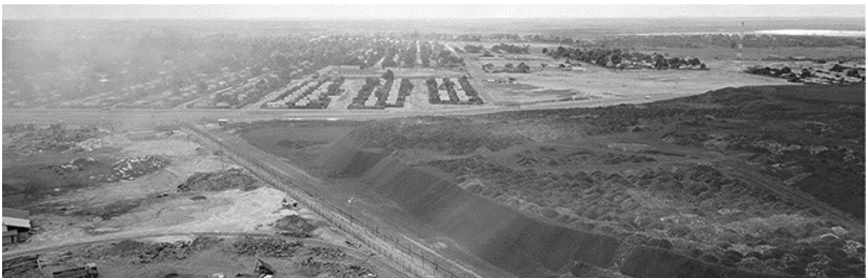
Switzerland is a hub for headquarters of transnational companies involved in mining, production, and trading of commodities, which affect the commons directly and indirectly. Mopani Copper Mines, Zambia (see Panel #A03).