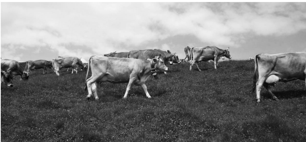
Communal Alpine Pastures in Sumvitg, Canton of Grisons, Switzerland (see Panel # B16).

The Graduate meeting is the perfect opportunity for graduate students to meet their fellow students and exchange their ideas, knowledge, and expertise in an informal setting. The meeting will start with a short introduction, delivered by one of the experts in the field of commons issues and will have ample room for discussion. Enjoy the company of your peers next to some drinks and snacks.