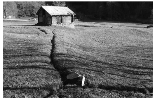
Irrigation channel in Naters

Over the centuries, various institutions for governing common pool resources such as water, pastures, and landscapes have been crafted and continuously adapted in the Naters region. Even nowadays, they play an important role in resource management and in the maintenance of an ecologically diverse landscape. Additionally, the commune is part of the Swiss Alps Jungfrau-Aletsch UNESCO World Heritage Site (WHS) region and has committed itself to preserve the diversity and uniqueness of the WHS for future generations. The excursion will give an insight into the large share of commons managed through diverse local institutions. A focus will be put on irrigation cooperatives, their long history and current challenges, and the processes of establishing and governing a WHS.